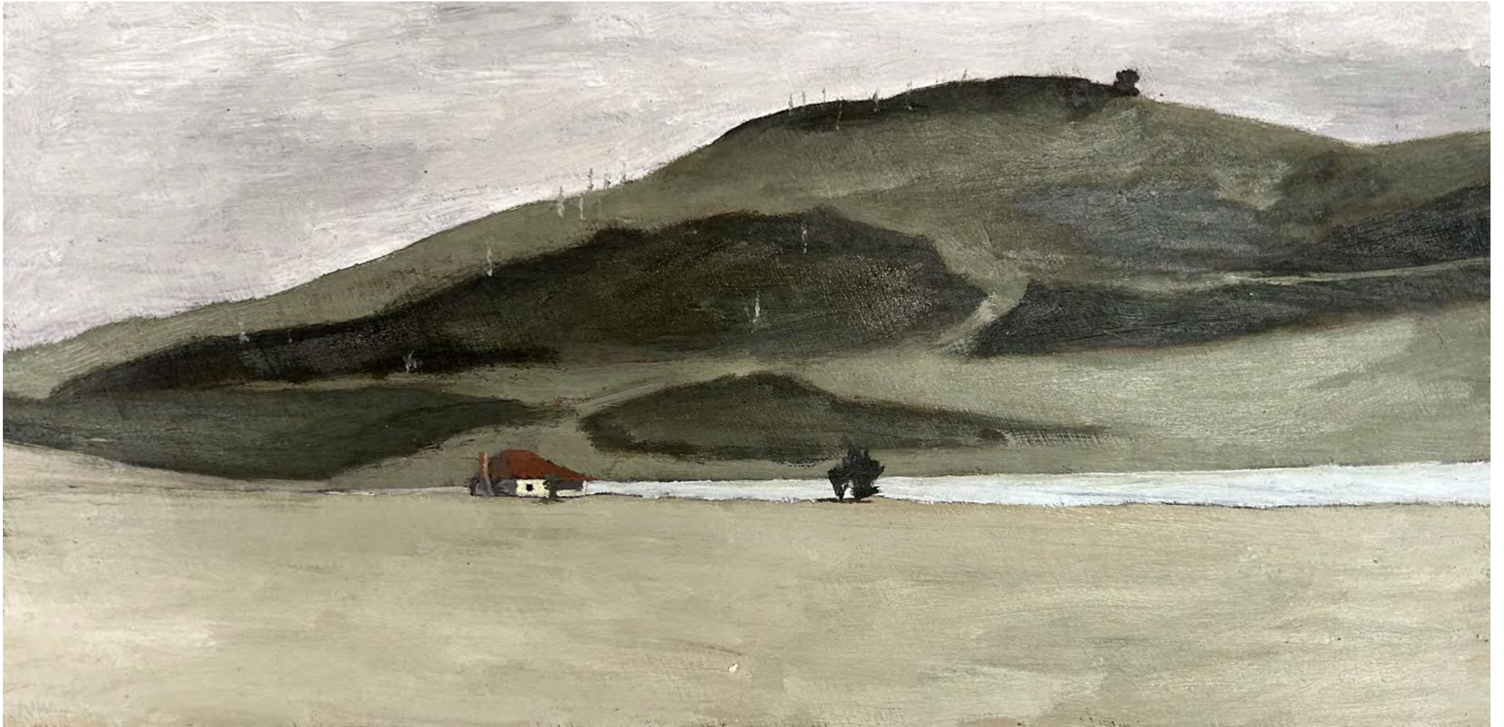
View from St. James, Jericho

oil on cedar panel 14 x 28cm, framed in raw timber $950