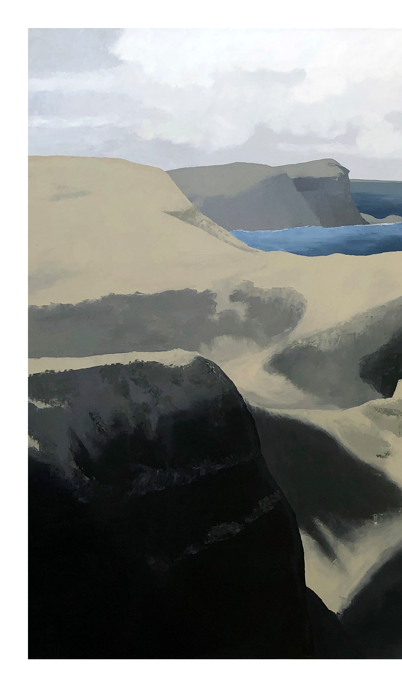
One More Day (View to Westernport from Barkers Bluff), 2022 oil on canvas 250 x 150cm (253 x 153cm framed in raw timber) $15,000