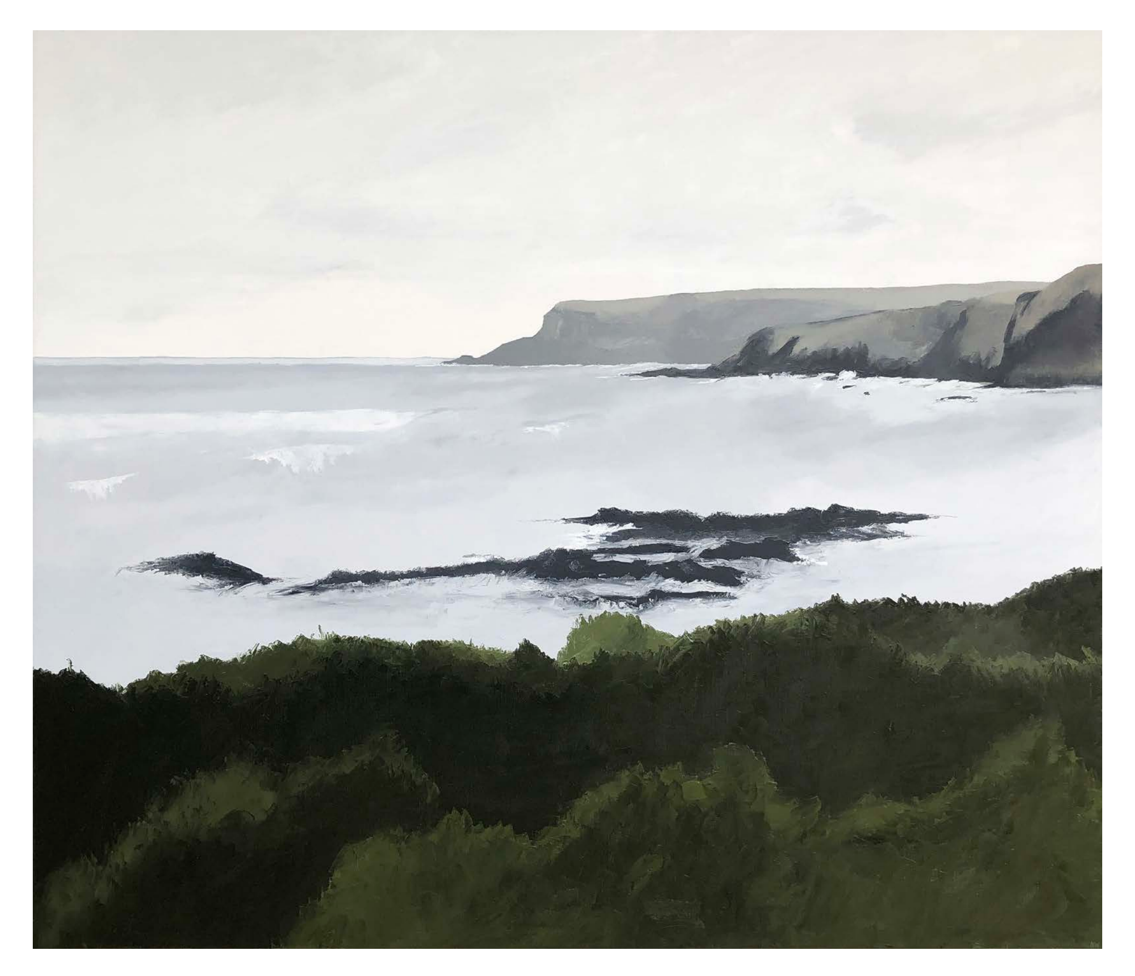
Softening (Flinders), 2022 oil on linen 117 x 101.5cm (119.5 x 104.5cm framed in raw timber) $5,500